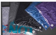
PP GARMENT PACKING BAGS