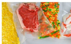
FOOD GRADE PACKING BAGS