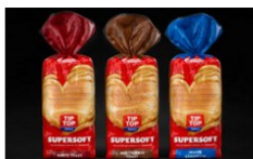
PP BREAD BAGS