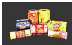
LD HM PP BAGS